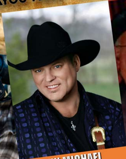
JOHN MICHAEL MONTGOMERY